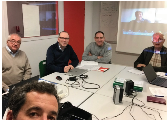
An impression of the Board of Director's Meeting in Paris in March 2023.